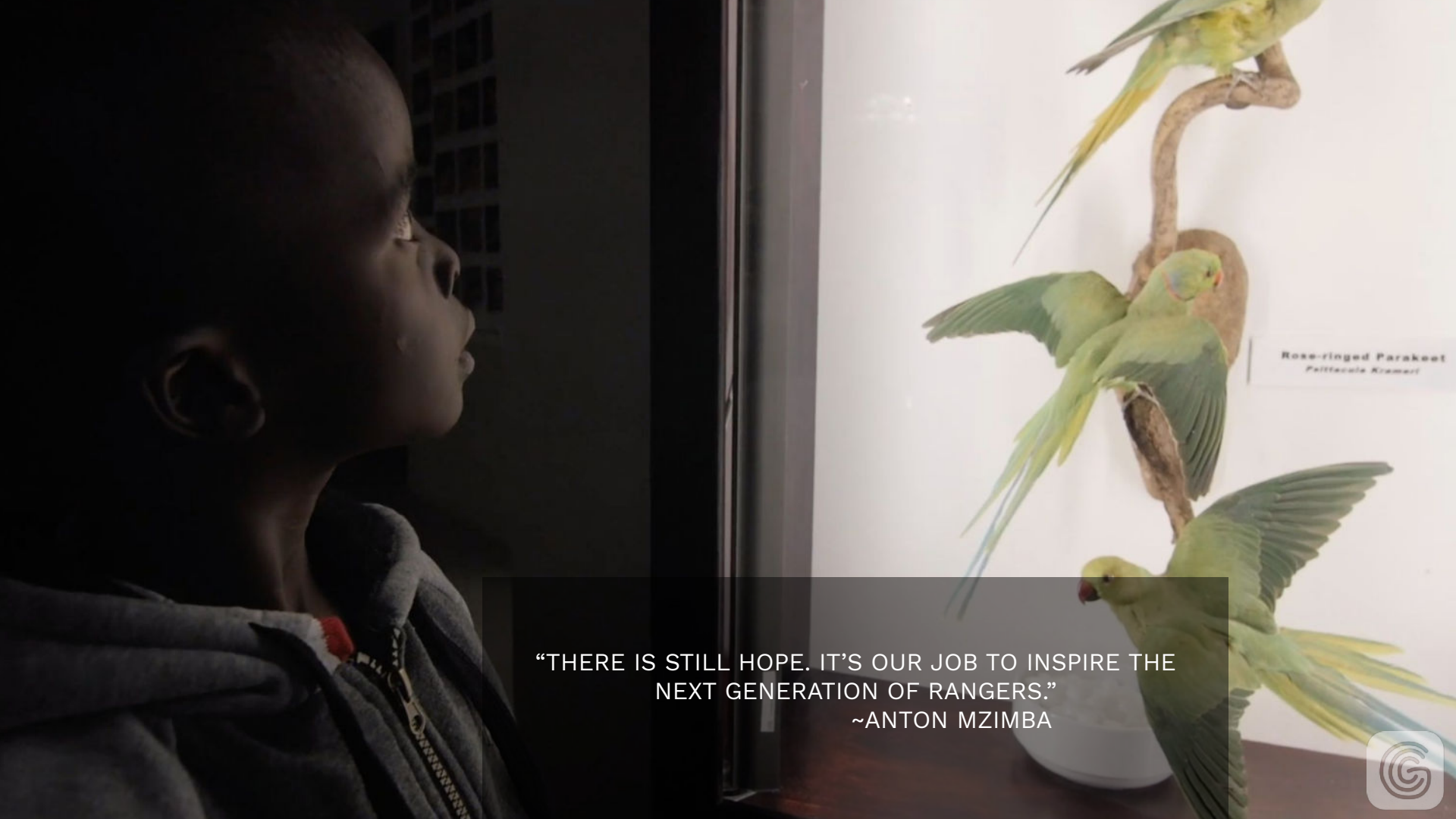
Rose-ringed Parakeet Ptilinopus krameri